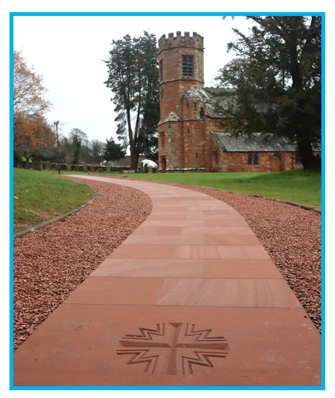
Seeking, choosing and meeting God